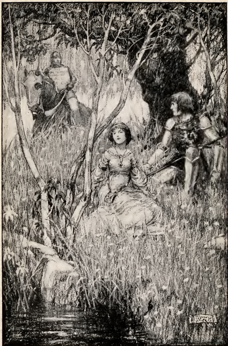
THEN WE STOPPED FOR A LONG NOONING UNDER SOME TREES BY A LIMPID BROOK. RIGHT SO CAME BY AND BY A KNIGHT RIDING